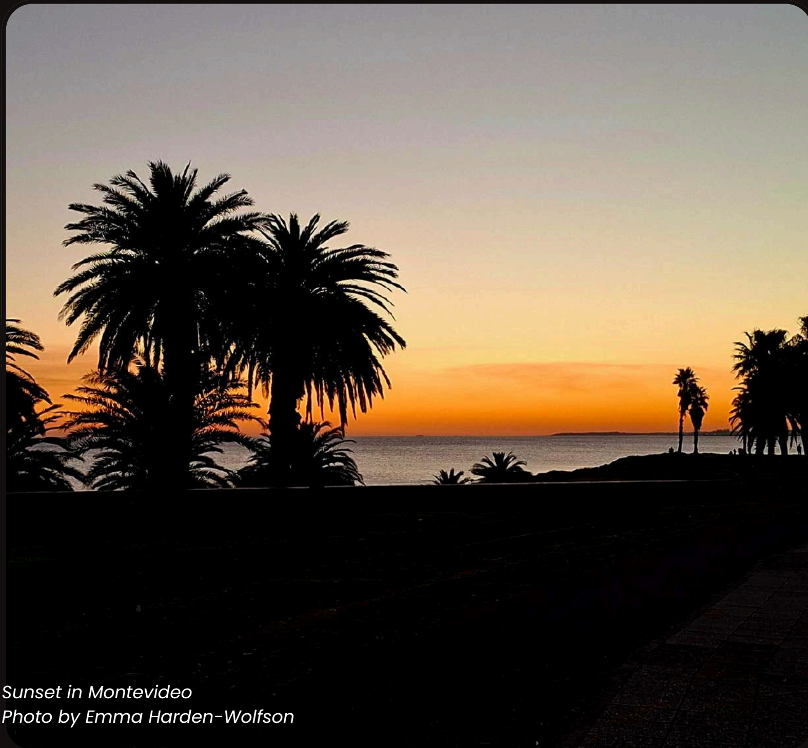
Sunset in Montevideo