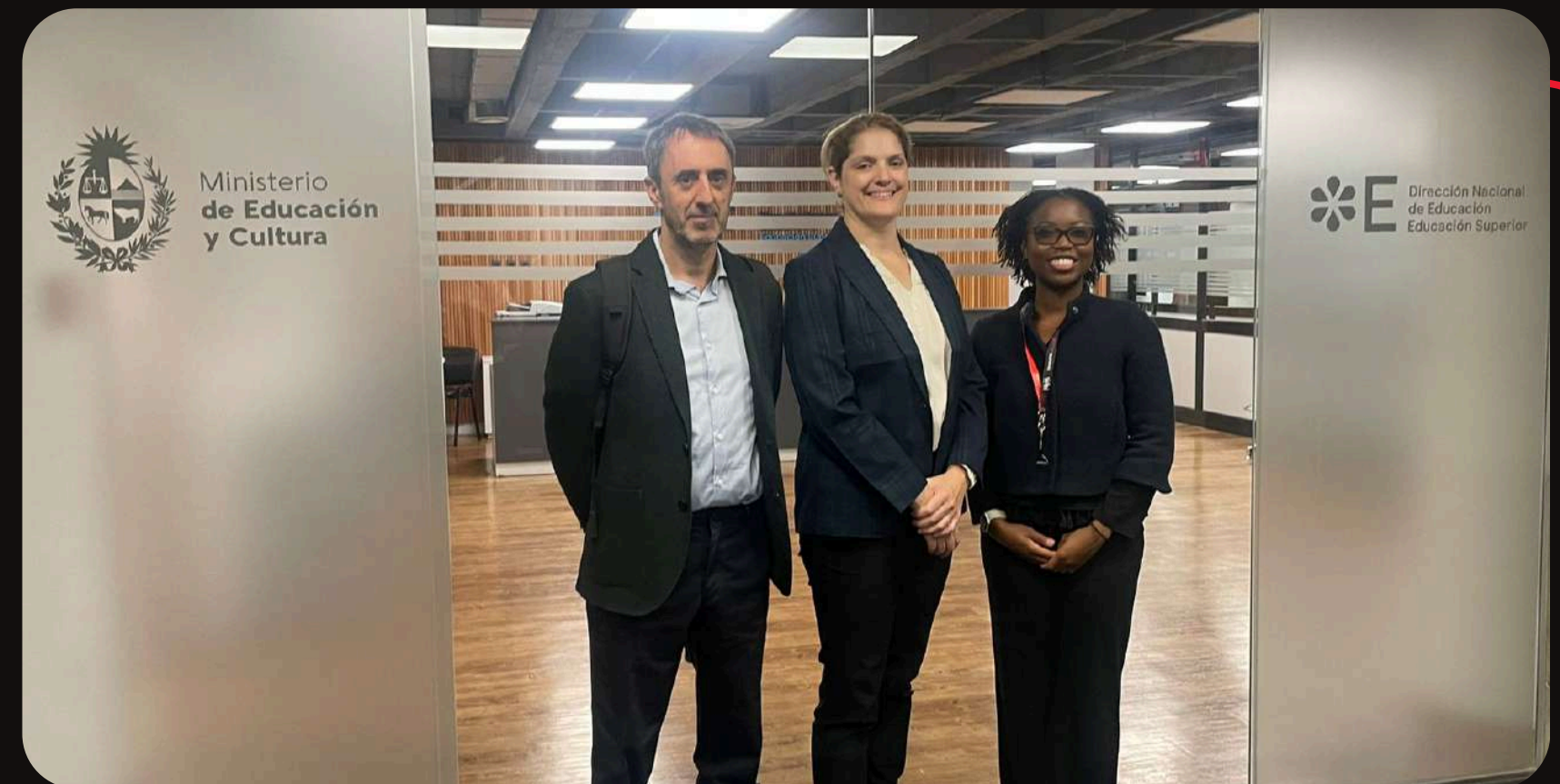
UNESCO IESALC and McGill team at the Ministry of Education and Culture