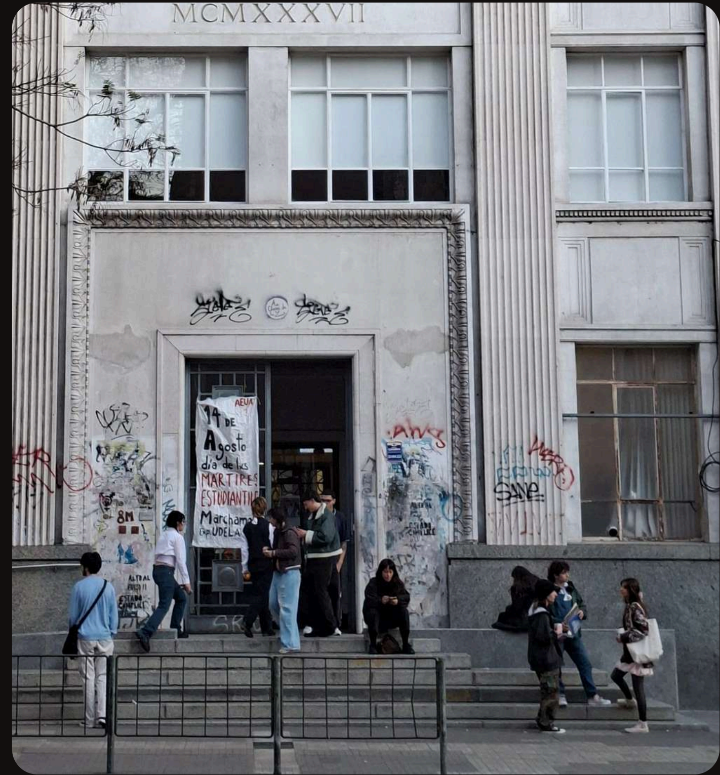
Former Lycée Français, Montevideo

Respondent: “Not everybody makes it out of high school and also [higher education is still]... concentrated in Montevideo. Not everybody makes it here, right? So just... not having tuition doesn't make university free.”