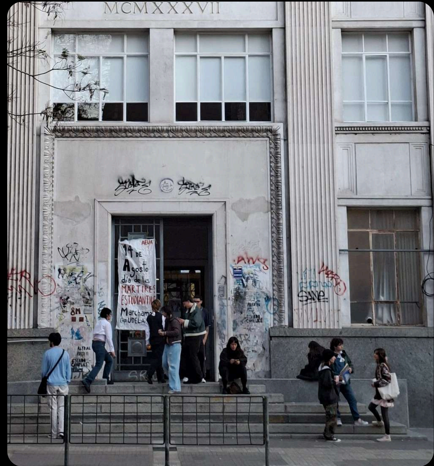
Former Lycée Français, Montevideo

Respondent: “Not everybody makes it out of high school and also [higher education is still]... concentrated in Montevideo. Not everybody makes it here, right? So just... not having tuition doesn't make university free.”