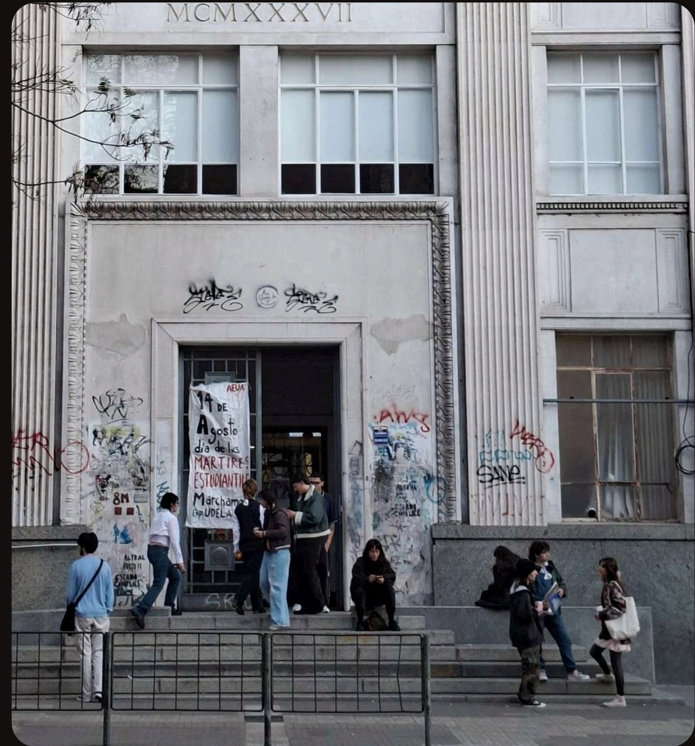
Former Lycée Français, Montevideo

Respondent: “Not everybody makes it out of high school and also [higher education is still]... concentrated in Montevideo. Not everybody makes it here, right? So just... not having tuition doesn't make university free.”