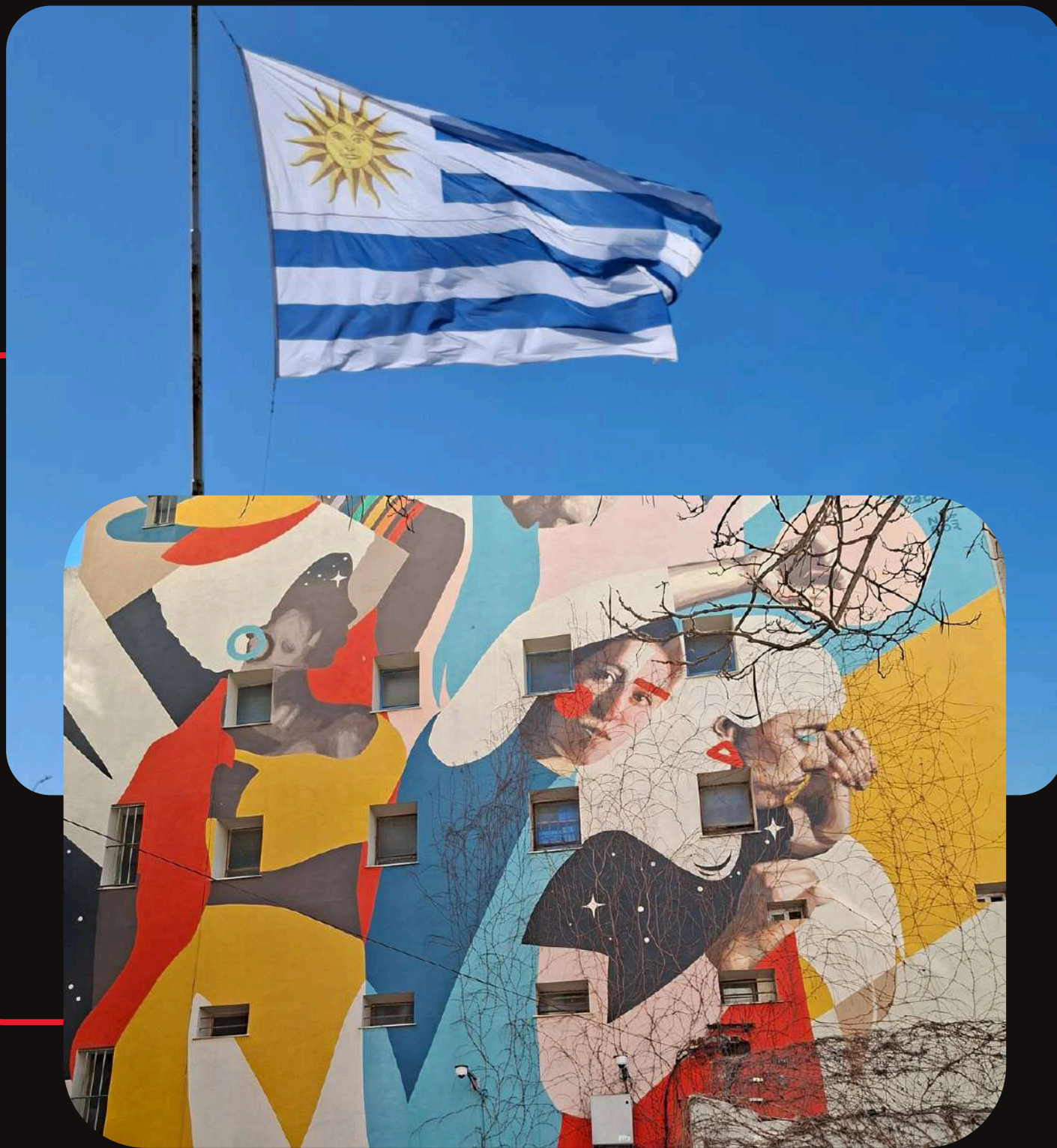
Mural, Montevideo