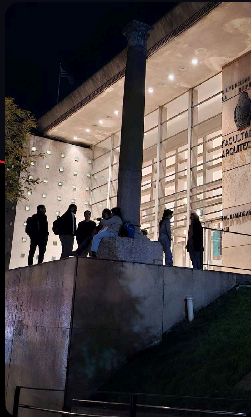
Faculty of Architecture, University of the Republic