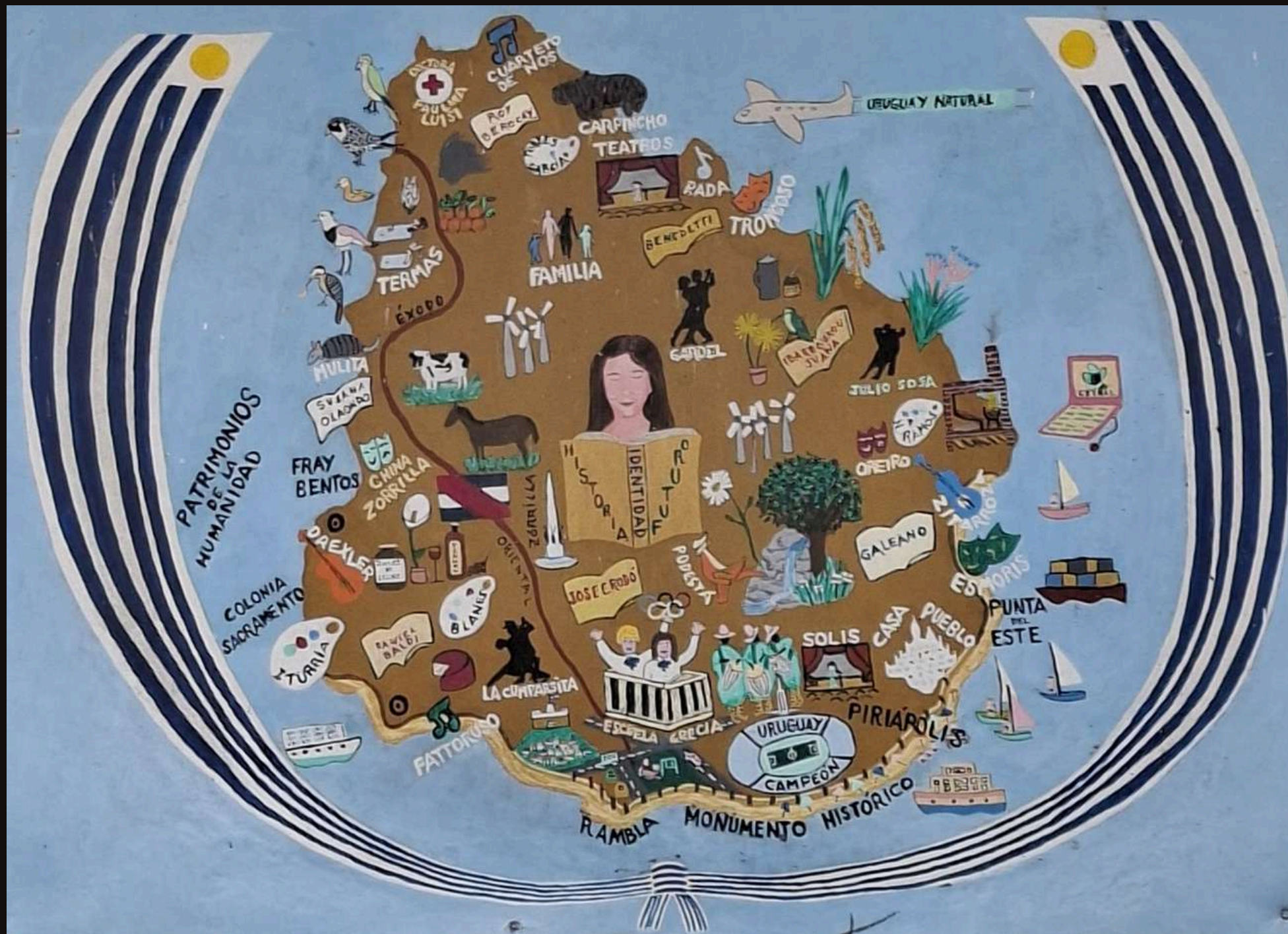
Map of Uruguay on the Escuela Grecia building, Montevideo

Territorial inequality: "Those who study in the interior have a lower offer of diversity and options"