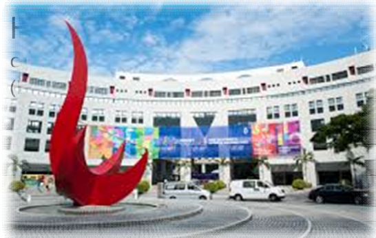
HKUST – Global knowledge networks, British colonial legacy, and Chinese traditions (Postiglione, 2013)