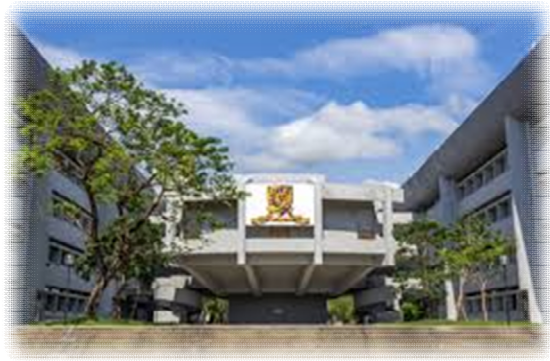
CUHK – Defusing the tensions between the pro-Beijing and pro-Taipei camps and containing communist influence in Hong Kong and Asia (Wong, 2005; Chou, 2010)